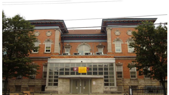
Neighborhood: Homewood North